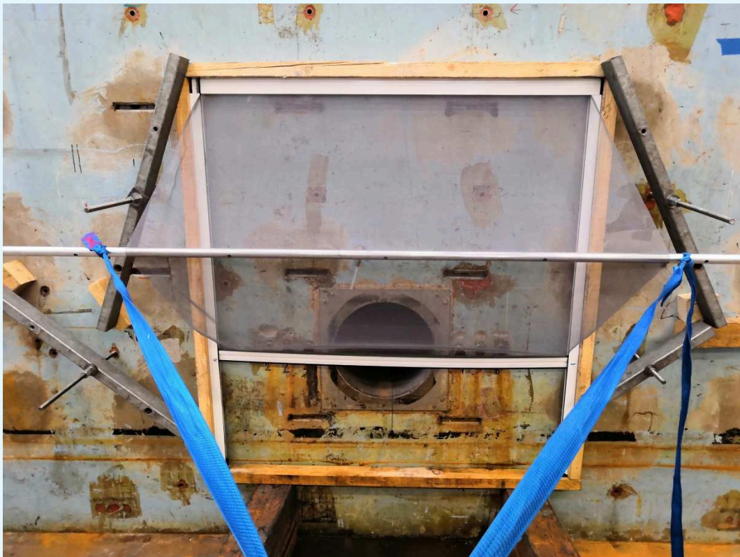
Photograph of the sample.

The sample is composed by curtain with stated openness coefficient "Co" 65%.