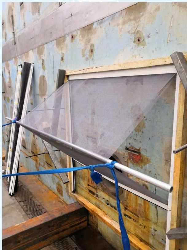
Photograph of the sample during test.